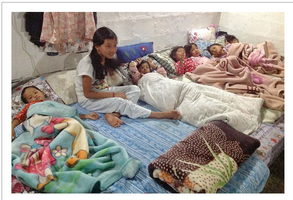
Our sewing room is serving as the temporary sleeping quarters during the construction on the House.