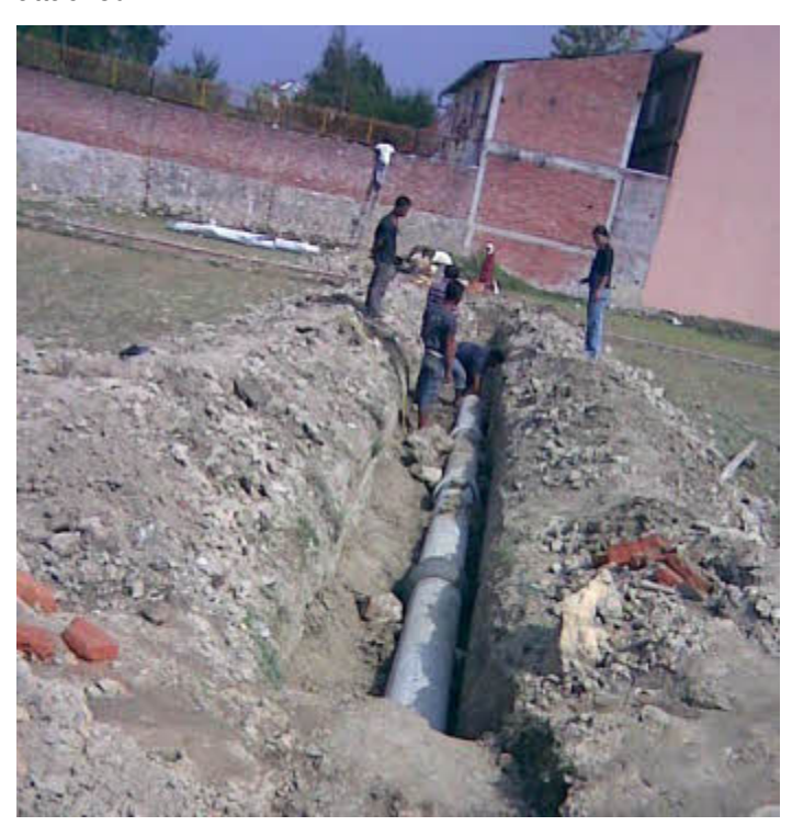
The sewer project on our new plot of land is nearing completion. Our wall and library are in the background of this photo.

We also undertook other construction projects. We built a food storage room adjoining the house, which frees up one bedroom for additional children. A classroom was constructed underneath the library, and atop the old septic tank we put two toilets with a covered bike shed/kennel attached.