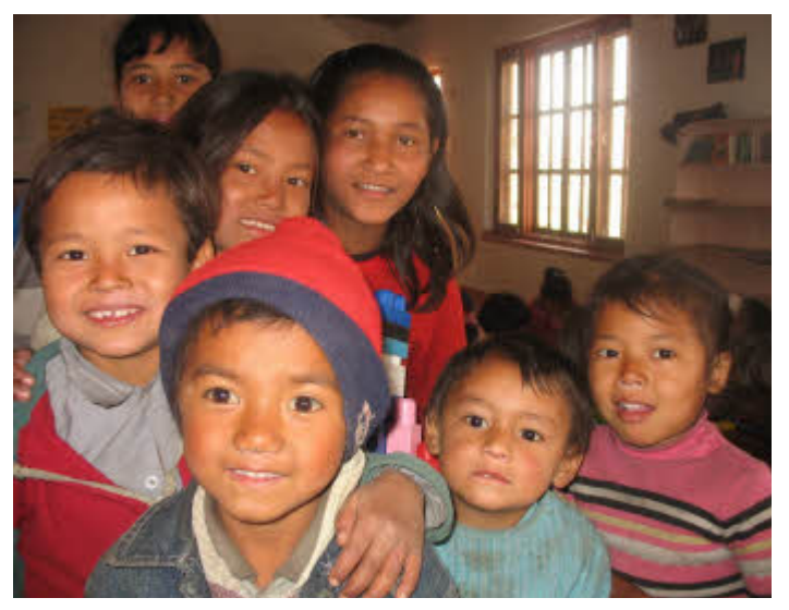
The parents of these children cannot afford school tuition. Our Children's Learning Centre provides them with a free education in reading, writing, and math. Twenty-six children attend daily classes funded in part by the Don Splawn Foundation East.