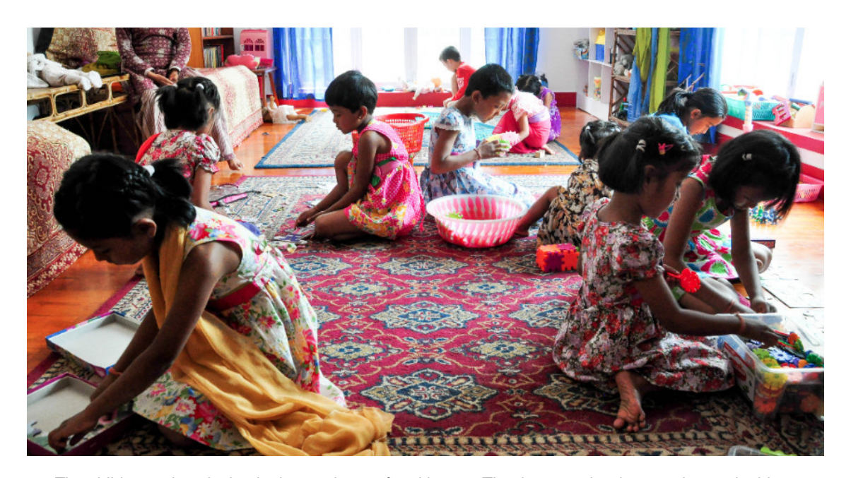
The children enjoy playing in the newly retrofitted house. Thank you to the donors who made this possible!