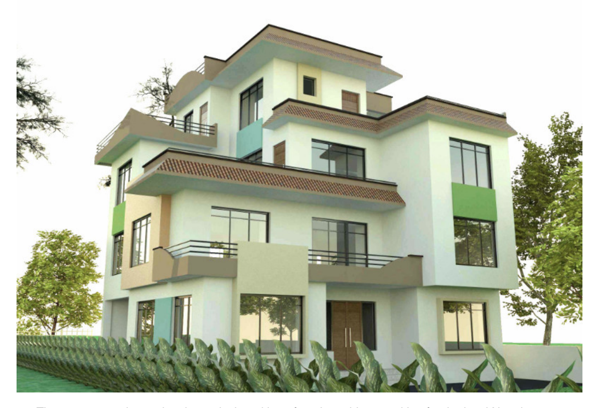
The new 3-story house has been designed by a female architect working for the local Nepal construction company S.S. Consult in consultation with New Line Structures Inc of New York. New Line has helped us to make sure that all of our buildings can withstand future earthquakes.