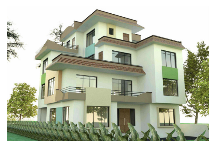
At year end, we had achieved 90% of our $200,000 goal to build a second house. This new house will allow us to take in 10 new children and expand our programs. The building was designed by Prativa Maharjan, a female Nepal architect, providing a role model for our girls.

In May 2016, one year after the earthquakes, the retrofitting of the house (a complicated and lengthy project) was completed, and the children and staff moved back in. The office, felt training room, and sewing room were also rebuilt. Other projects included a new well, water filtering system, and solar work. With the completion of the reconstruction project, all of our programs were restarted and operating at near capacity levels in 2016.