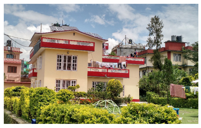
The house underwent extensive reconstruction & retrofitting to withstand any future earthquakes.