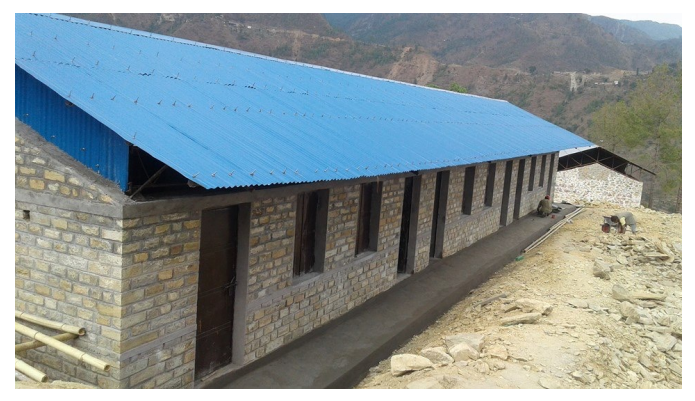
The Tarkeshori School, located in a remote village high in the Himalaya Mountains, was rebuilt as part of the House with Heart School Rebuilding Program.

People in Nepal continue the struggle to recover from the earthquakes. The work of House with Heart has never been more critical. With that in mind, we initiated a Capital Campaign to build a new multi-purpose house that will allow us to significantly increase our outreach to those in need. We raised over $179,000 (90%) towards our goal of $200,000 during 2016. Generous lead donors kicked off the campaign with a $50,000 anonymous donation, and, most recently, the kind people at ABS/DBG Group of Li & Fung and the Li & Fung Foundation in Hong Kong donated over $33,500. Construction will begin early in 2017 .